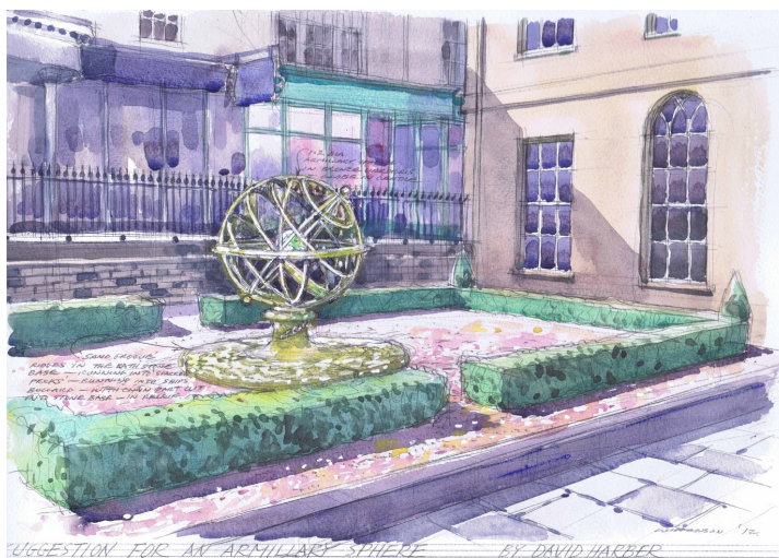
Artists impression of the Bath Armillary Sphere

DETAILS ON UP DATED WEST COUNTRY SITE - www.britozwest.org.uk